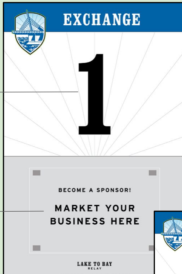
SPONSOR CARD 12 IN X 18 IN