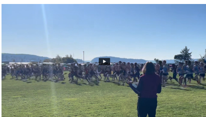
2023 State XC Qualifiers!