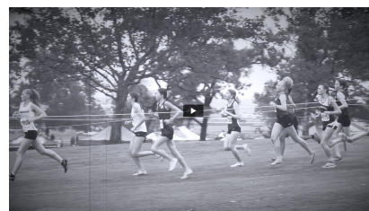
2023 State XC Participants!