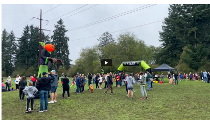
Halloween Dash Bash!